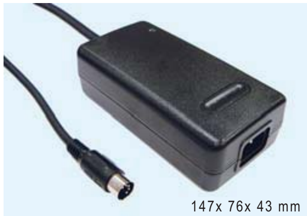
147x 76x 43 mm