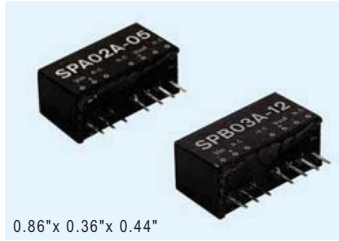
0.86"x 0.36"x 0.44"