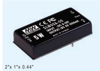
2"x 1"x 0.44"