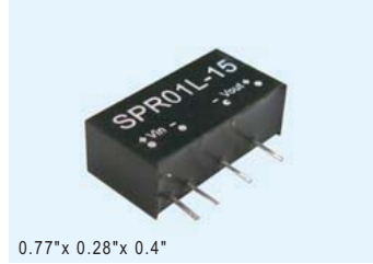
0.77"x 0.28"x 0.4"